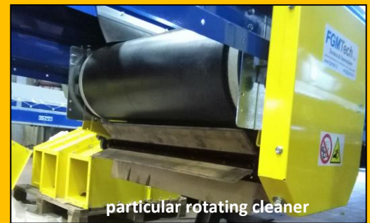
particular rotating cleaner