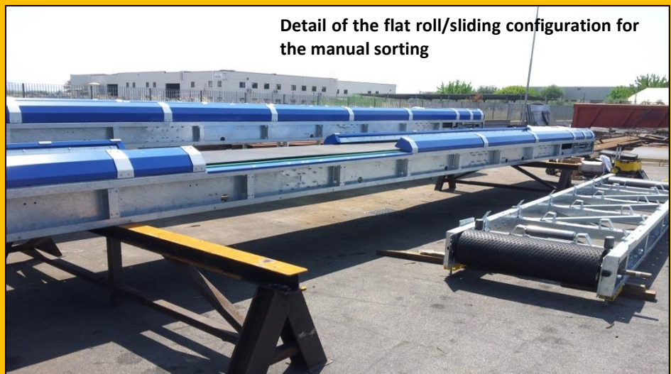
Detail of the flat roll/sliding configuration for the manual sorting

All the Mod. NB Conveyor Belts comply with the current Machinery Directives and are supplied with Identification Plate, Use and Maintenance Manual with CE marking.