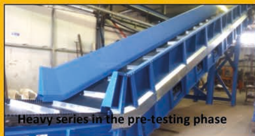
Heavy series in the pre-testing phase

All FGM Tech Heavy conveyor belts, although based on standard construction specifications, are designed and built upon the customer's request, thus allowing to identify the type, the size as well as the inclination that are more suitable for the use context.