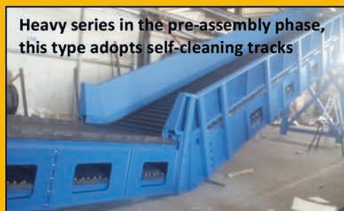
Heavy series in the pre-assembly phase, this type adopts self-cleaning tracks