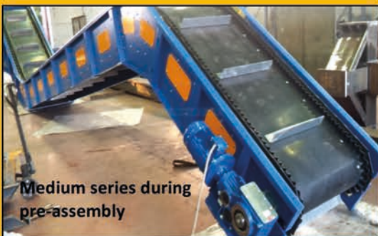
Medium series during pre-assembly

The design philosophy that characterizes FGM Tech , based on modularity, practicality, product integrability and constant reliability, allows you to create products easy to maintain and/or re-evaluate over time in alternative contexts. In fact, every component of the Heavy Conveyor Belt becomes automatically a spare part that can be easily replaced.