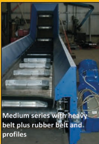
Medium series with heavy belt plus rubber belt and profiles

Every Heavy conveyor belt can be provided with integral Heavy belt or with heavy belts plus casing with rubber belt, starting from a minimum width up to larger widths.