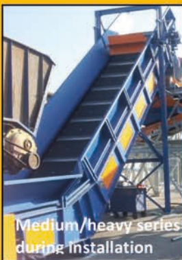
Medium/heavy series during installation

The design philosophy that characterizes FGM Tech , based on modularity, practicality, product integrability and constant reliability, allows you to create products easy to maintain and/or re-evaluate over time in alternative contexts. In fact, every component of the Heavy Conveyor Belt becomes automatically a spare part that can be easily replaced.