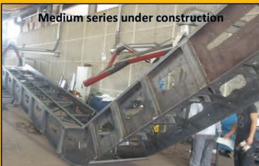
Medium series under construction

The FGM Tech Heavy Conveyor Belts are machines designed and manufactured to be used in multiple fields of application. In fact, thanks to the experiences in the sector of industrial transport and handling, the company has identified and integrated into its own products a series of tested characteristics that allow Heavy conveyor belts to meet all the user's needs.