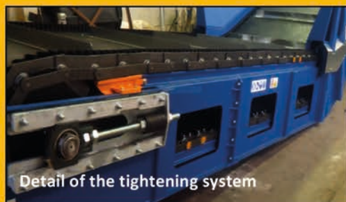
Detail of the tightening system

All FGM Tech Heavy conveyor belts, although based on standard construction specifications, are designed and built upon the customer's request, thus allowing to identify the type, the size as well as the inclination that are more suitable for the use context.