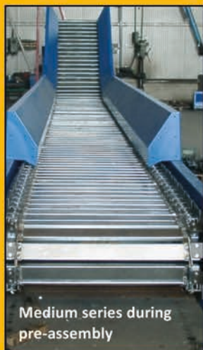
Medium series during pre-assembly